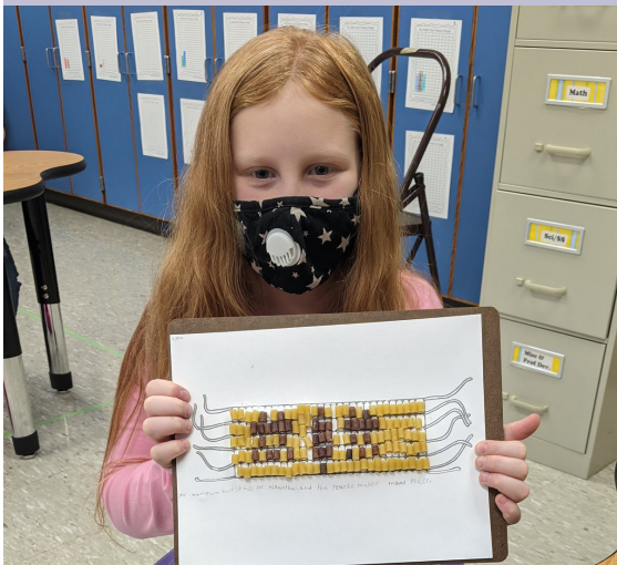
HOME OF THE BLUE DEVILS

Voters will also decide on a separate proposition to purchase three 66 passenger school buses at a cost not to exceed $354,000.